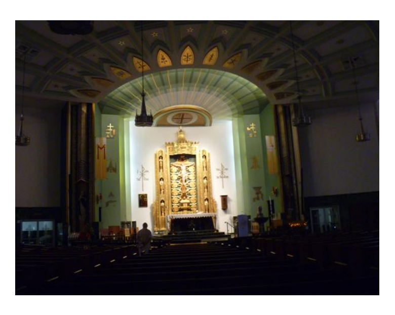
Which Chicago Archdiocese church is this one? The answer will be in next month's issue.

Last month's mystery church was St. Helen, in WestTown.